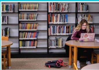
Timberwolf Learning Lab